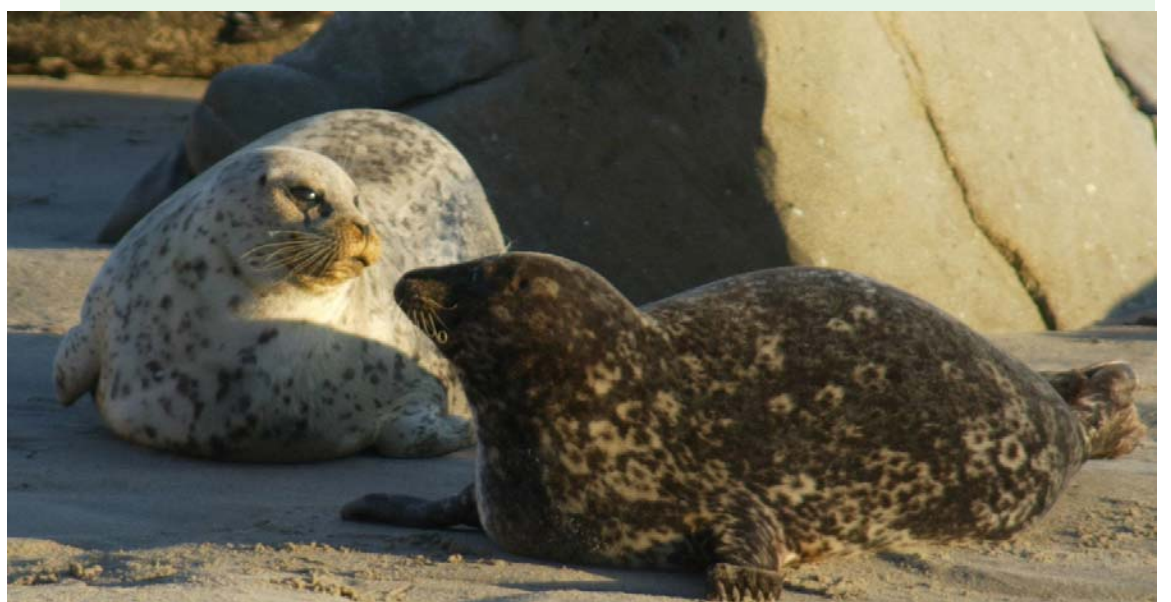
The threats Paredon creates to marine mammals, such as these harbor seals, cannot be mitigated to less than "significant" levels no matter what measures are taken.

The hearing schedule can be found on the city's website at http://www.carpinteria.ca.us and it will be updated as dates, times, and places are determined for each step. ❖