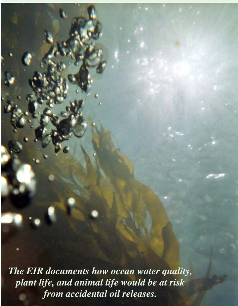
The EIR documents how ocean water quality, plant life, and animal life would be at risk from accidental oil releases.